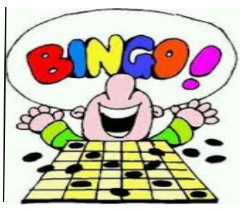
December 7th, 14th, 21st and 28th

New members are welcome at any time. Suggestions on authors & books are gladly accepted. Large Prints Available